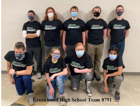
Greenwood High School Team 8791

You are expected at all times to be polite and respectful to all school staff members and refrain from activities that are considered disruptive. Any team member receiving a disciplinary action of any type is subject to review by the coaches and can receive a demerit.