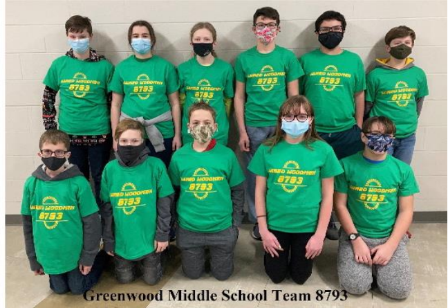
Greenwood Middle School Team 8793